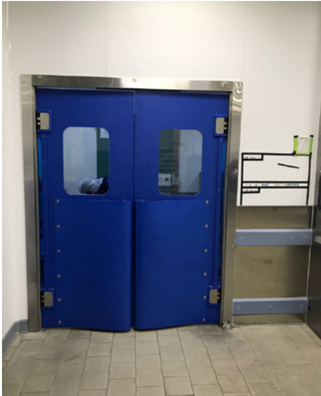
HDPE teardrop bumper 47" high