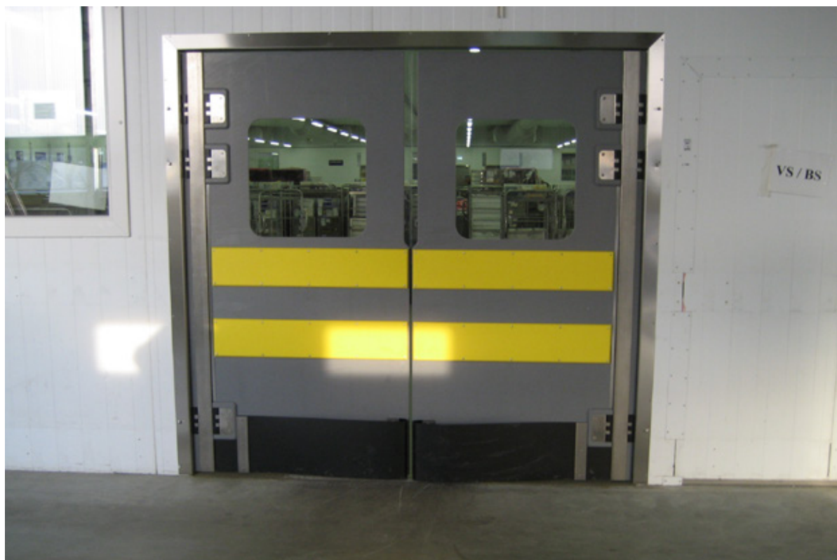
GP360 PE traffic door with impact panels, teardrop bumpers and square window 24" x 24"