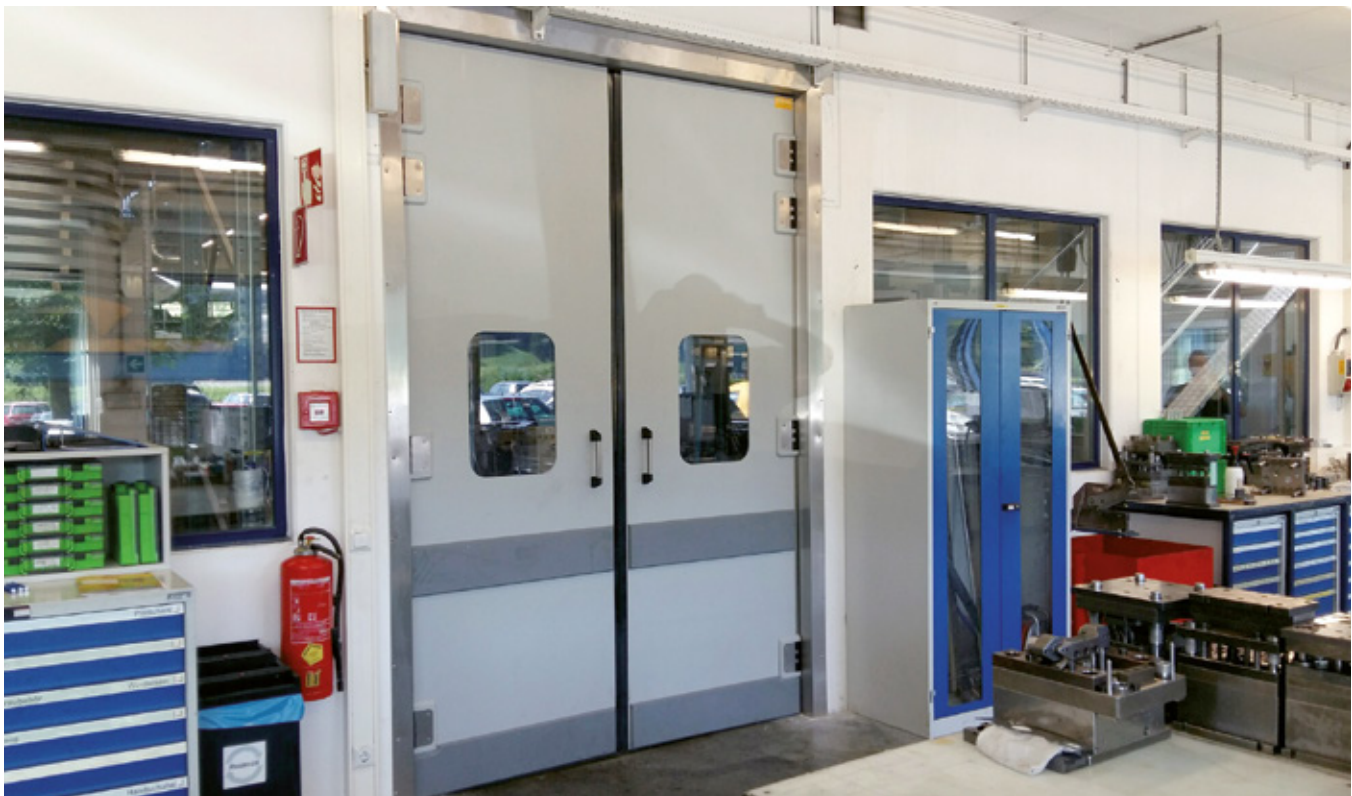
In workshop with stainless steel frame, handle, impact plates and finger protection