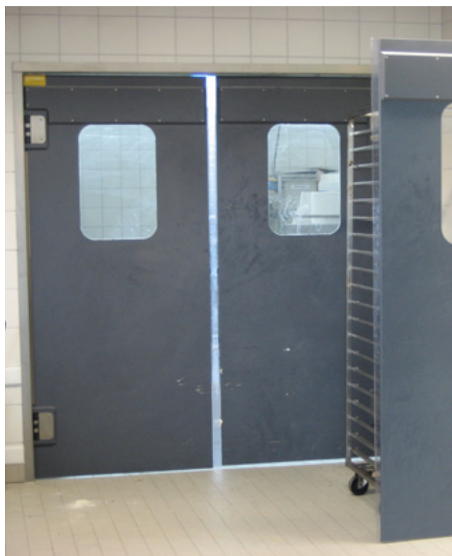
Impact panel above window and PVC finger protection