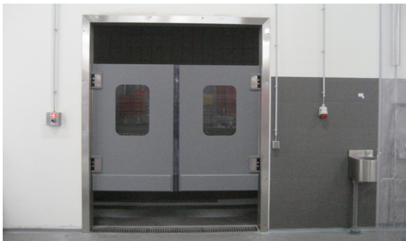
Between changing rooms and production area including stainless steel frame