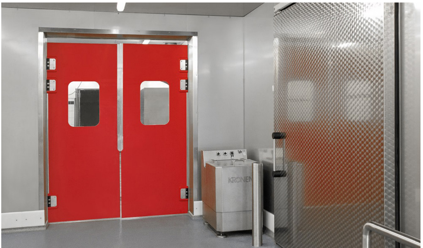
In cold storage with stainless steel flat frame riveting on existing frame