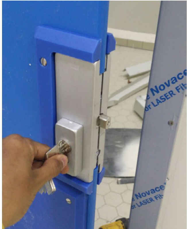
Stainless steel lock and PE lock protection