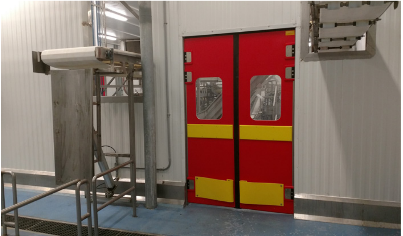
HDPE impact panel and teardrop bumper and front gasketing