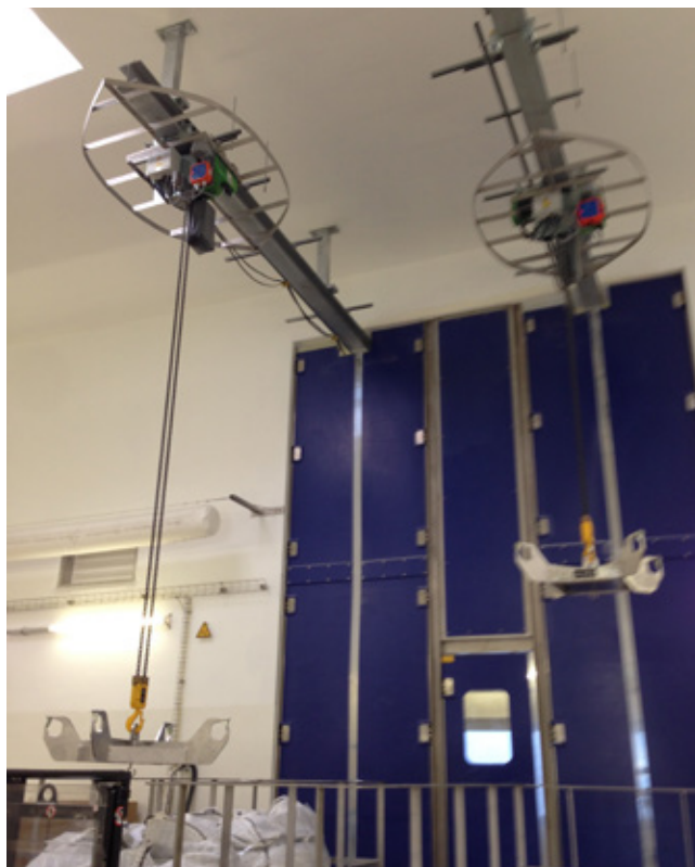
Gate system of two large traffic doors 61" x 220"